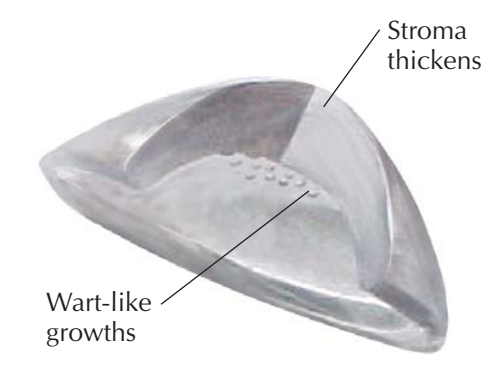
Fuch's Endothelial Dystrophy