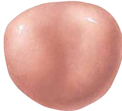
Prostate is enlarged with symmetrical surface and has soft, slight median furrow, indicating BPH. 5.5cm x 5.01cm, 65 cc