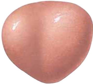
Prostate is enlarged with soft, smooth surface. Right lobe is larger. Indicates BPH and/or possible cancer. 4.7cm x 4.21cm, 30cc

BPH BENIGN PROSTATIC HYPERPLASIA: The prostate begins to increase in size at age 45 in most men, and can continue to grow for the rest of a man's life. By itself, prostate enlargement, is not a problem.