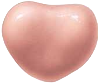
Normal size. 4.2cm x 3.5cm, 20cc

BPH BENIGN PROSTATIC HYPERPLASIA: The prostate begins to increase in size at age 45 in most men, and can continue to grow for the rest of a man's life. By itself, prostate enlargement, is not a problem.